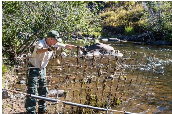
A volunteer helps remove the fence separating Hubbard's Summer Place and the Sarvis State Wildlife Area.

The day began with the symbolic removal of a cross-river fence that separated the Sarvis State Wildlife Area and the Hubbard Summer Camp property, as well as the addition of a fence ladder to enhance access between the two parcels. Volunteers from the Yampa Valley Flyfishers and the BLM and Forest Service removed heavy cabling and old barbed wire. Colorado Parks and Wildlife supported the effort by creating a staging area for the project, providing supplies, and hauling off fencing material that was removed from the river and its banks.